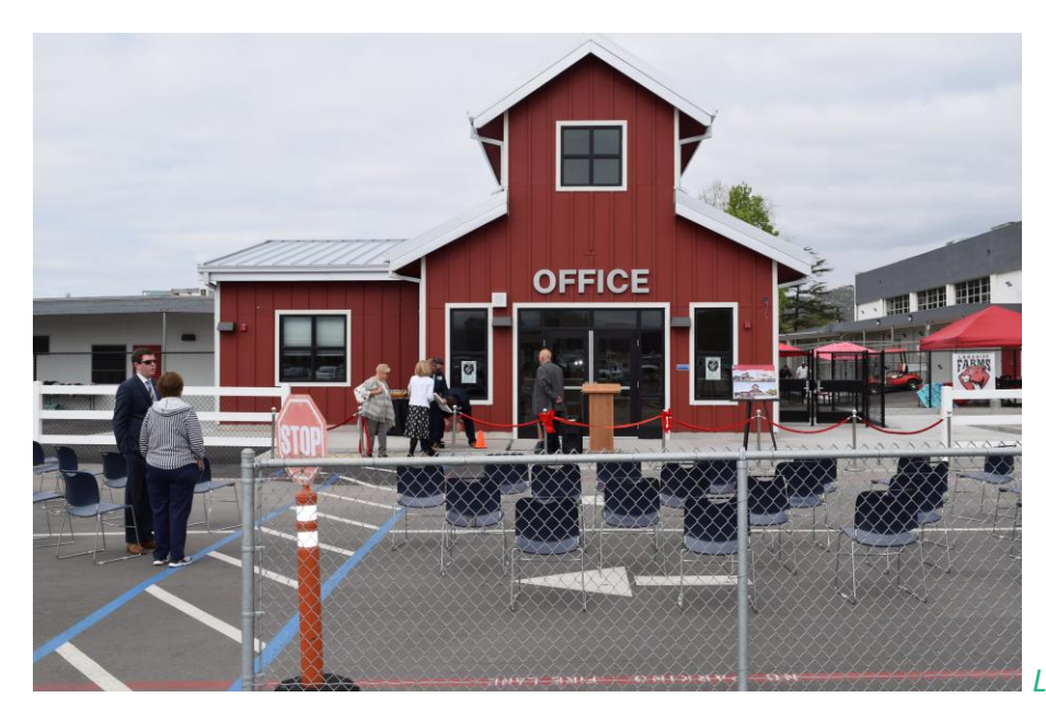
Lakeside Farms – Modernization