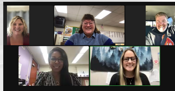
TDS SpEd Team