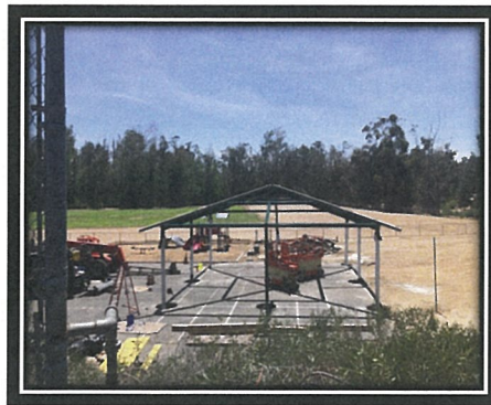
EH – SHADE SHELTER