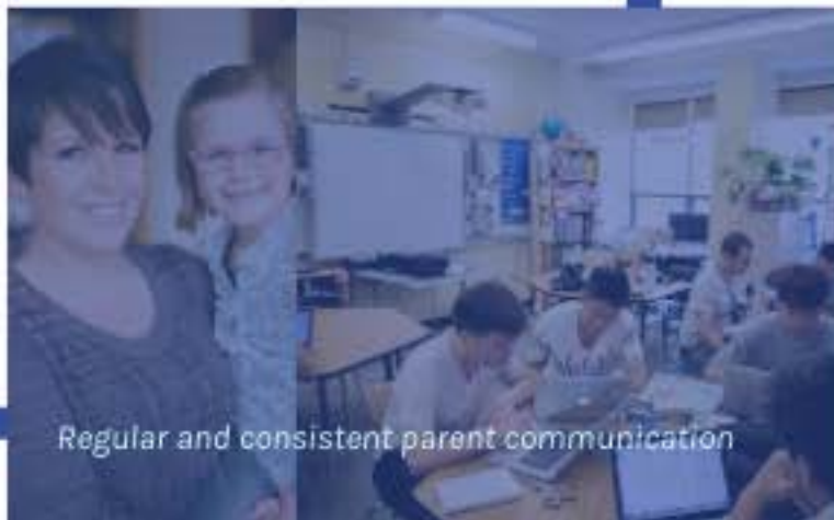
Regular and consistent parent communication

Procedures for reengaging students who are absent for more than 60% of instruction per week